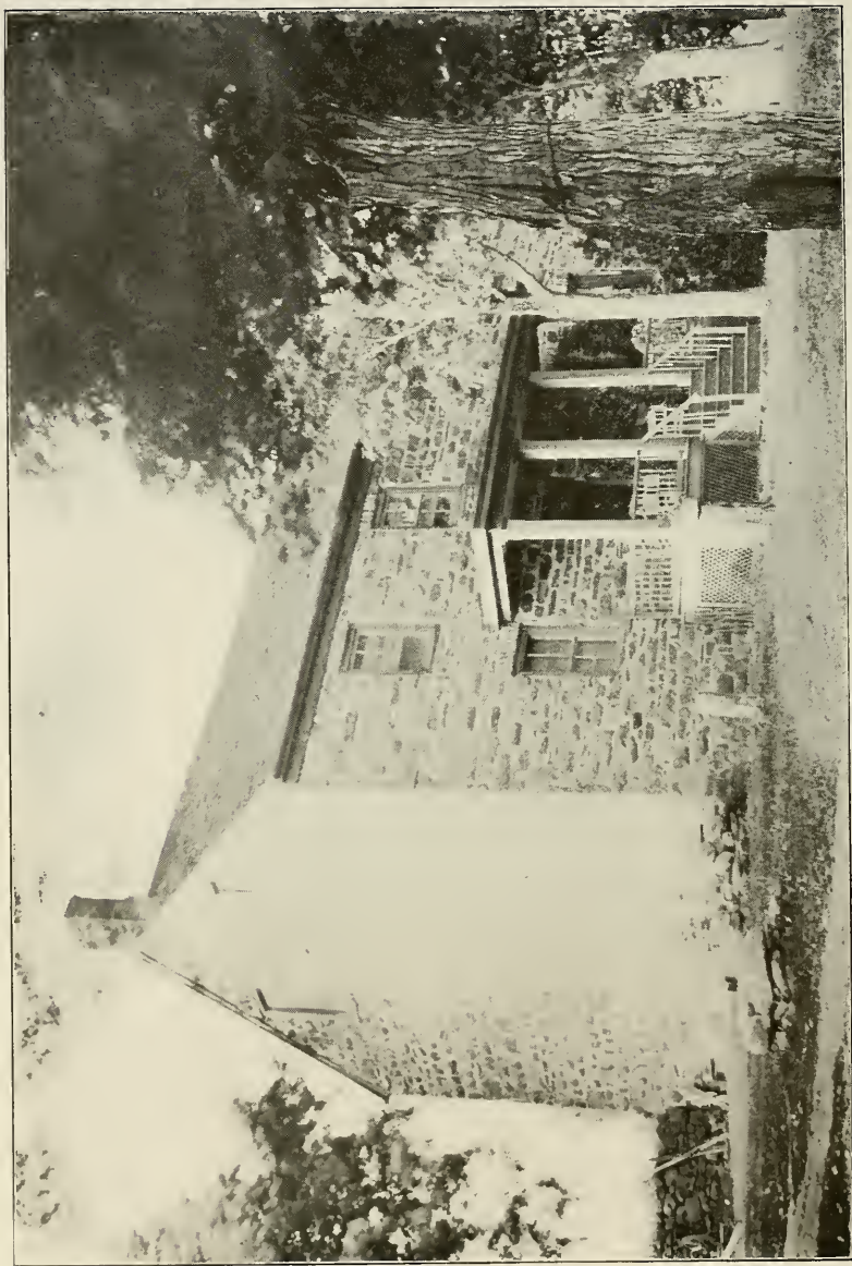
STONEFIELD HOUSE. BUILT, 1745.

From a photograph taken in 1905 by David Barclay Day, of Newburgh, N. Y.